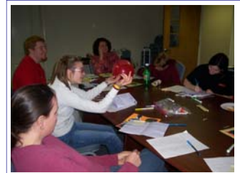
Youth create goals for MYCOT youth at a recent workshop