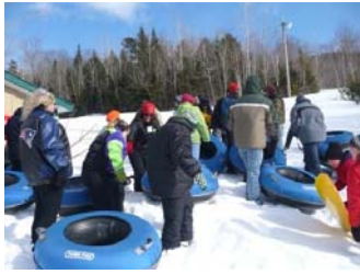
Health & Fitness last year. Youth in the County enjoyed a cold day of tubing at Big Rock in Mars Hill