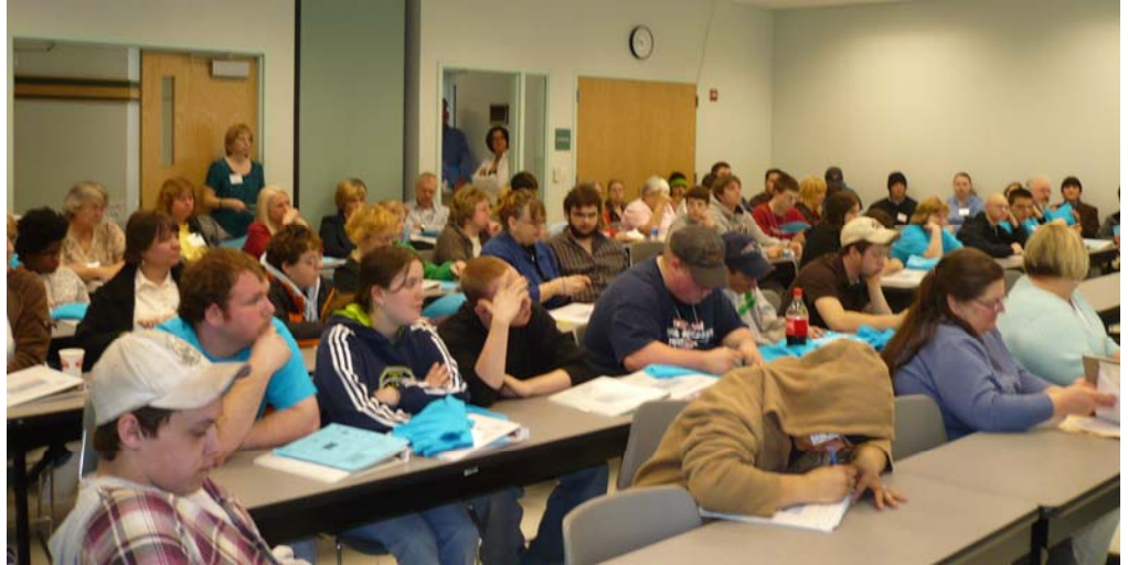
Mission Transition: The Katahdin Summit Youth attend employment and educational workshops last year at Mission Transition

Mission Transition @ Date: Friday, March 13, 2009 Time: 8:30—1:30 Place: University of New England in Biddeford Call 446-3540 to pre-register