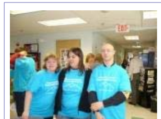
Youth at Mission Transition: The Katahdin Summit last April 2008